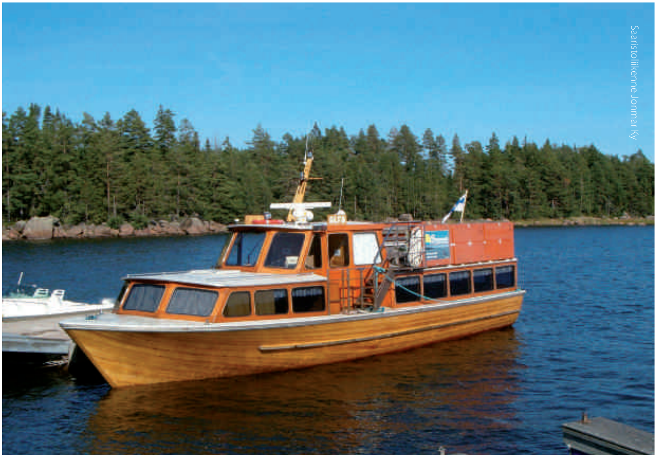
Saariöilikkene Jonnar Ky