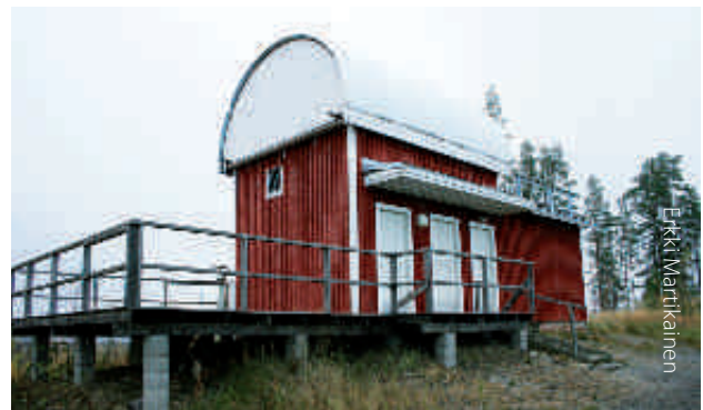
University of Joensuu's observatory

In addition to the museum canal project, which is aimed at promoting tourism, the Jakokoski villagers have