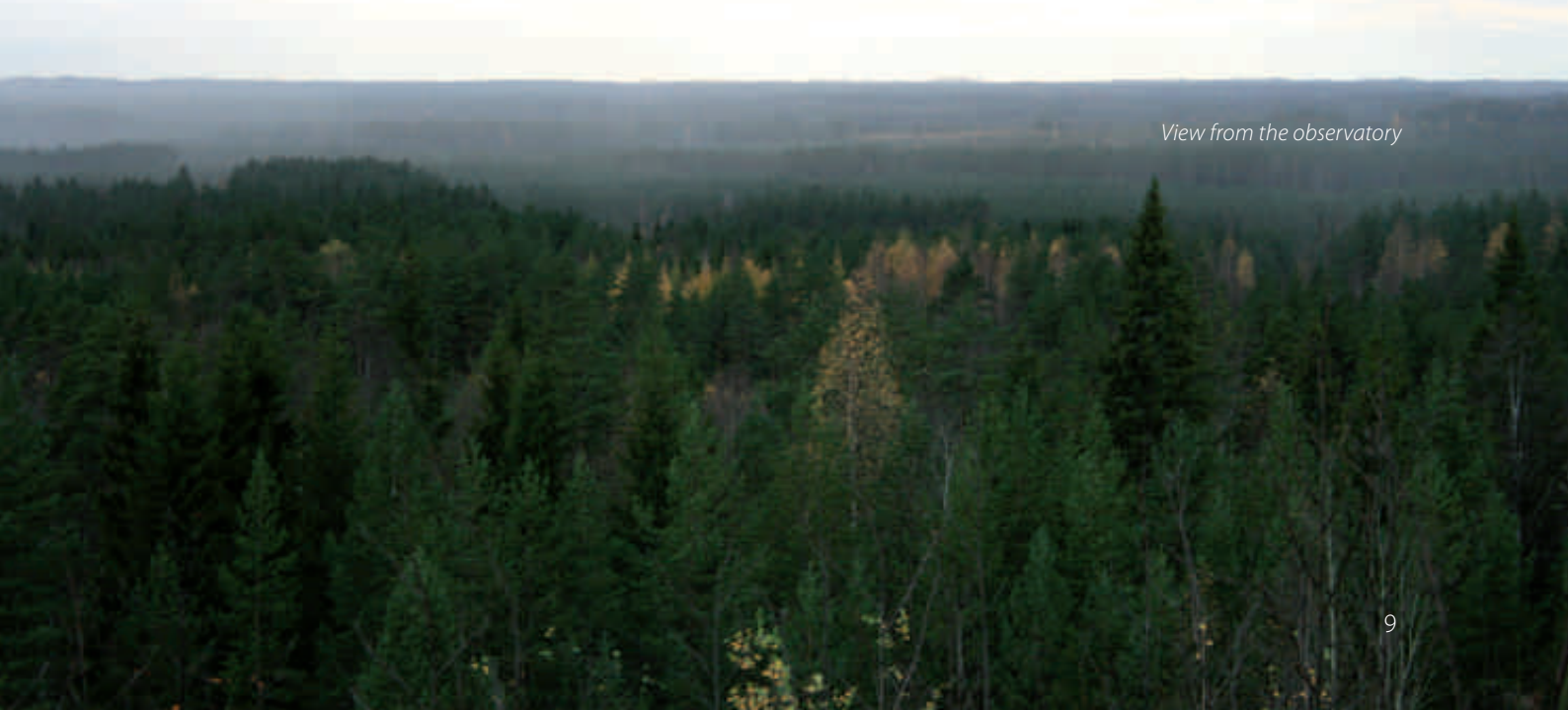
View from the observatory

compiled a book about the village, arranged puppet theatre performances and erected an environmental artwork. In the latest project, the villagers have renovated conference premises for rent in an old arsenal connected with the University of Joensuu's observatory.