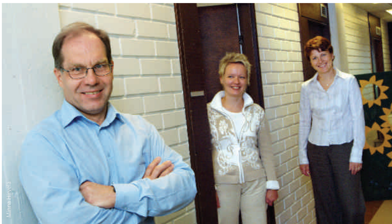
Staff of the Development Association of the Seinäjoki Region

In Finland the Leader local action group (LAG) is a registered association that develops rural areas by funding local rural development projects and granting support for enterprises. There are 56 LAGs in Finland, and their activities cover the whole country.